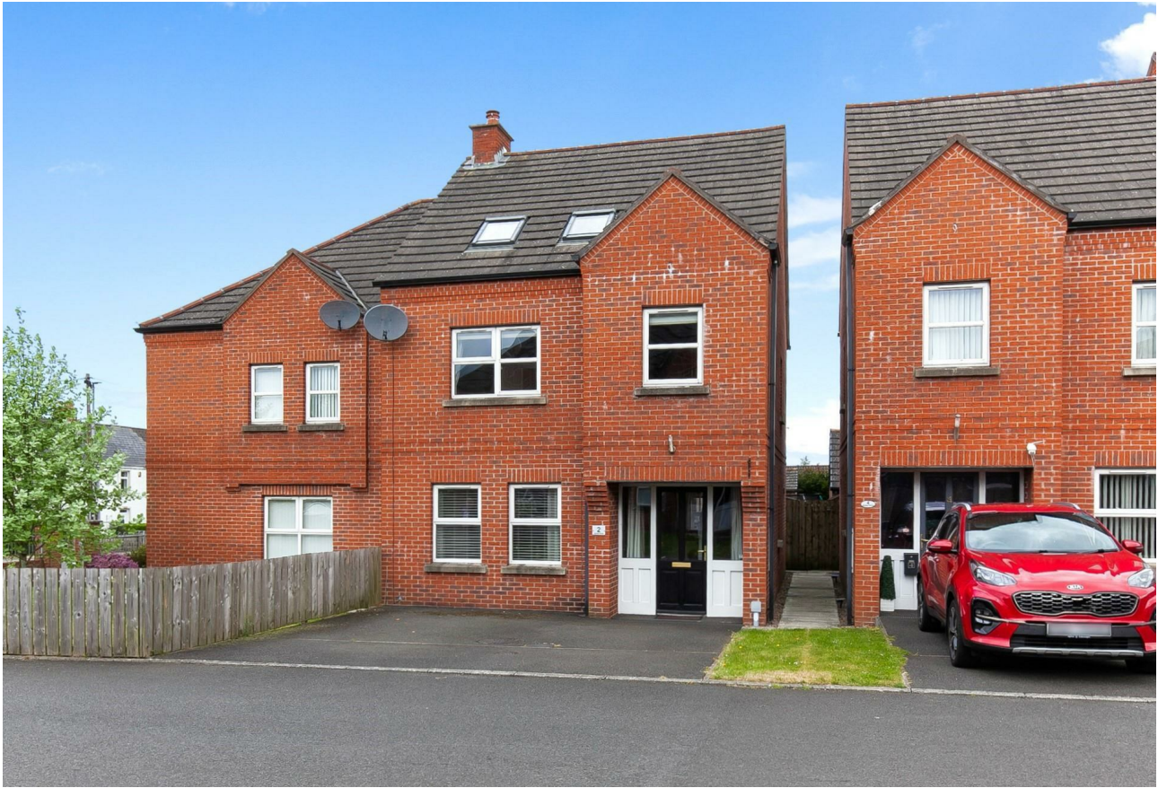
2 Jubilee Drive, Ballyrobert, Ballyclare, BT39 9LA